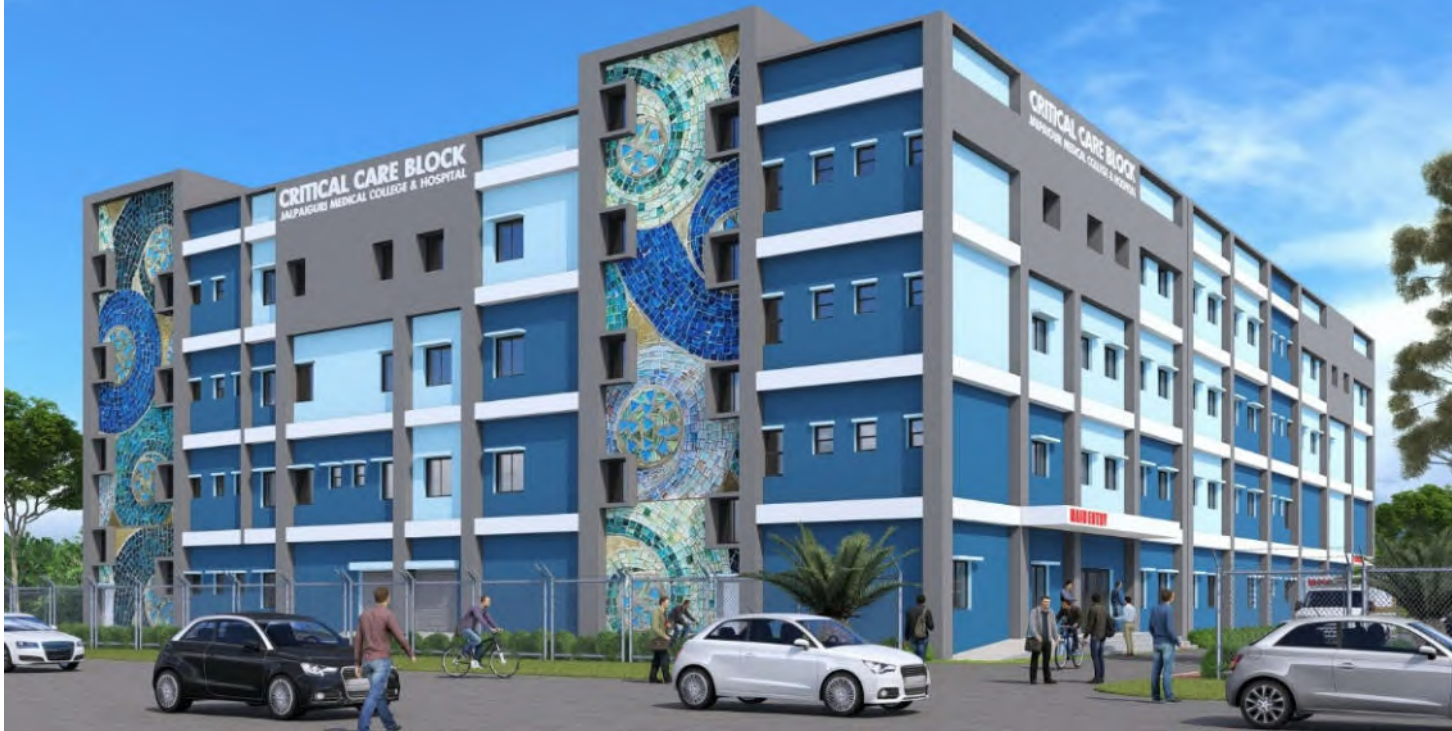
4 storied Critical Care Block (100 Bedded) at Jalpaiguri Govt. Medical College & Hospital Project Cost: 30 crores/ Area: 7638 sqmt.