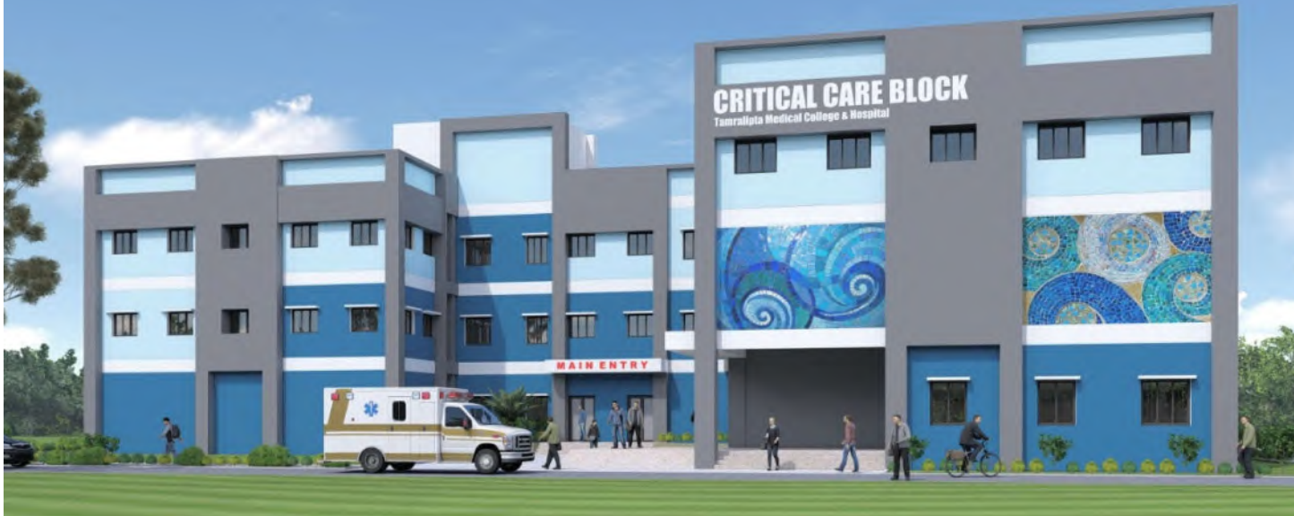
3 storied Critical Care Block (50 Bedded) at Tamralipta Govt. Medical College & Hospital Project Cost: 16.9 crores/ Area: 3820 sqmt.