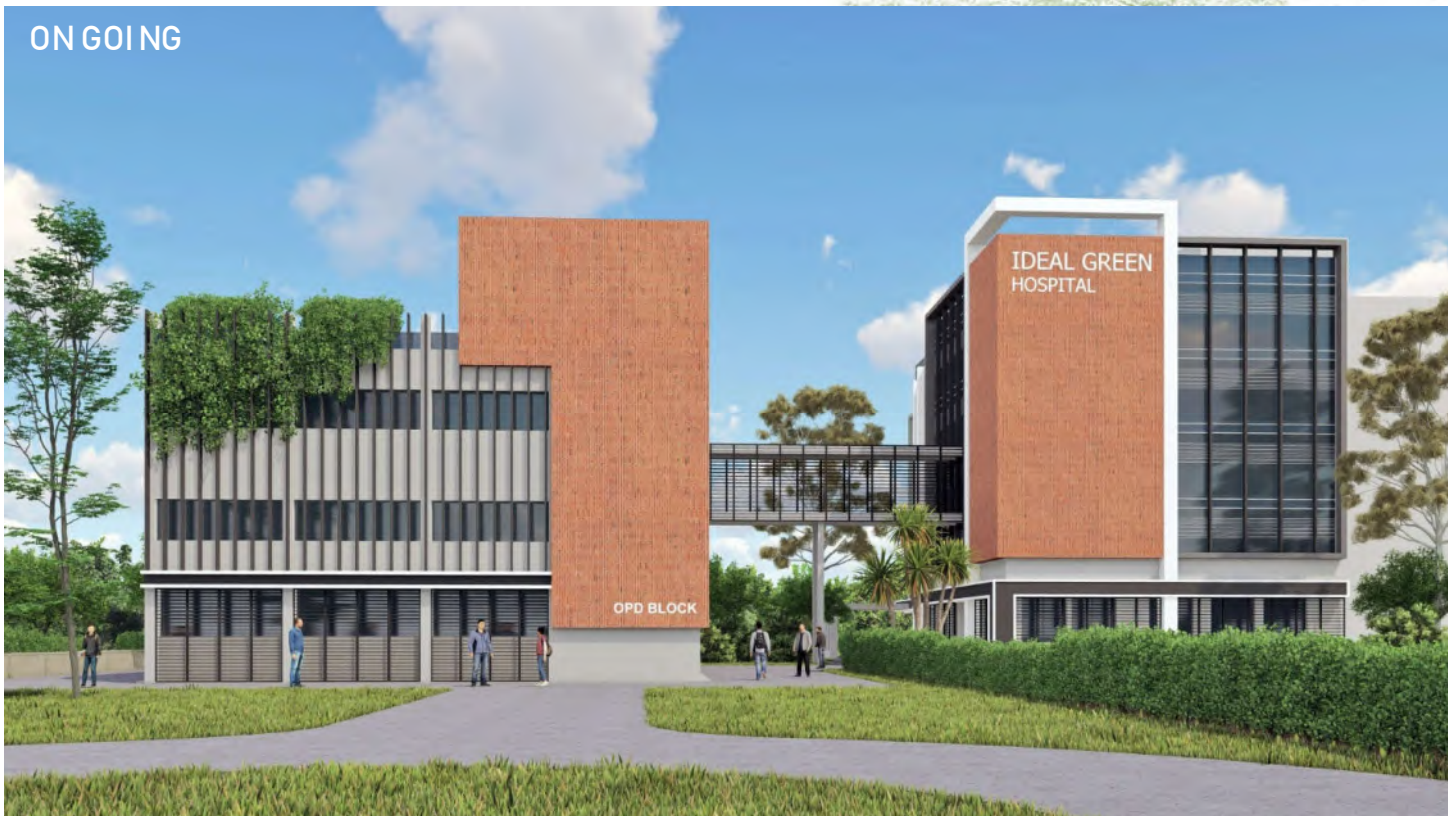
100 Bedded IDEAL Green Hospital at Uluberia Project Cost: 18 crores/ Area: 3716 sqmt.