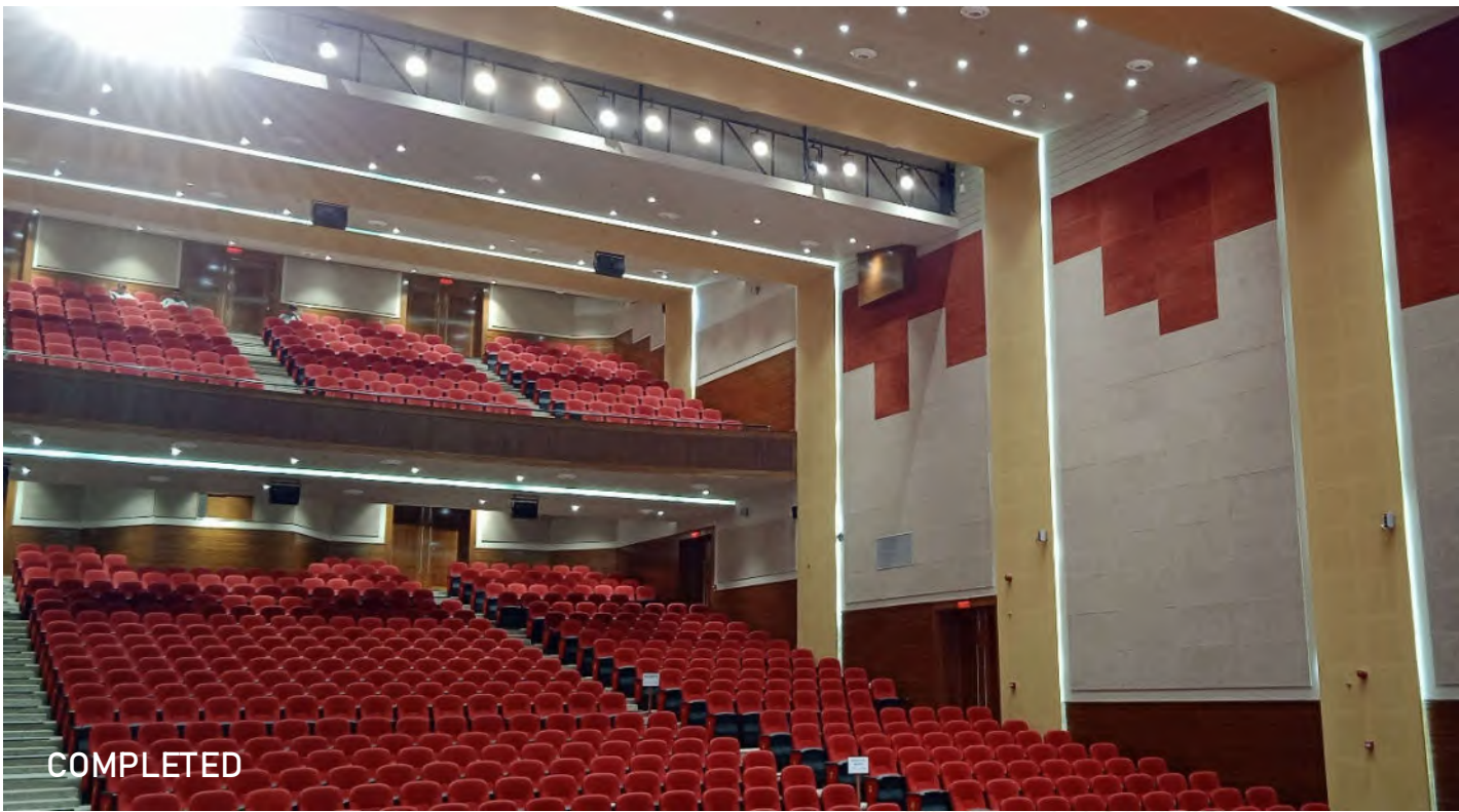
Vivekananda Auditorium (500 seater) at Vivek Tirtha, New Town Project Cost: 27 crores