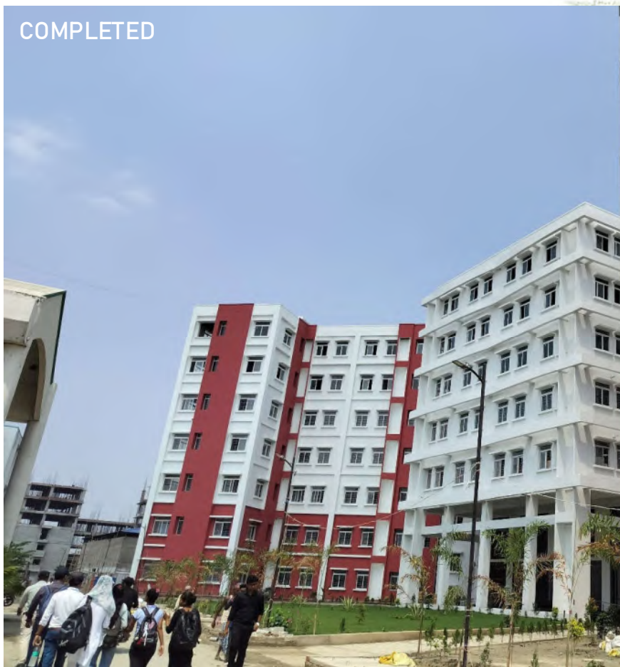
Barasat Medical College & Hospital at Barasat Project Cost: 255 crores/ Area: 68670 sqmt.