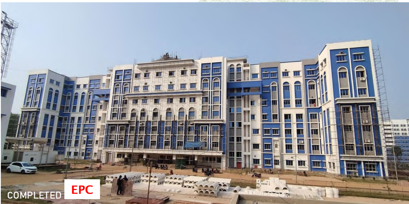
Jhargram Medical College & Hospital at Jhargram Project Cost: 255 crores/ Area: 68670 sqmt.