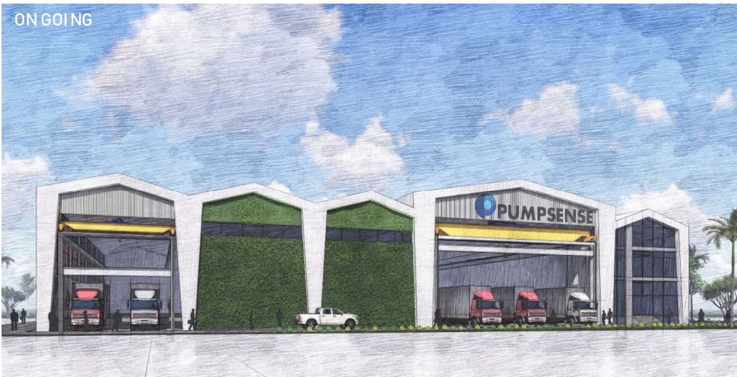
Pump Manufacturing Unit at Domjur, Howrah Project Cost: 15 crores/ Area: 4180 sqmt.