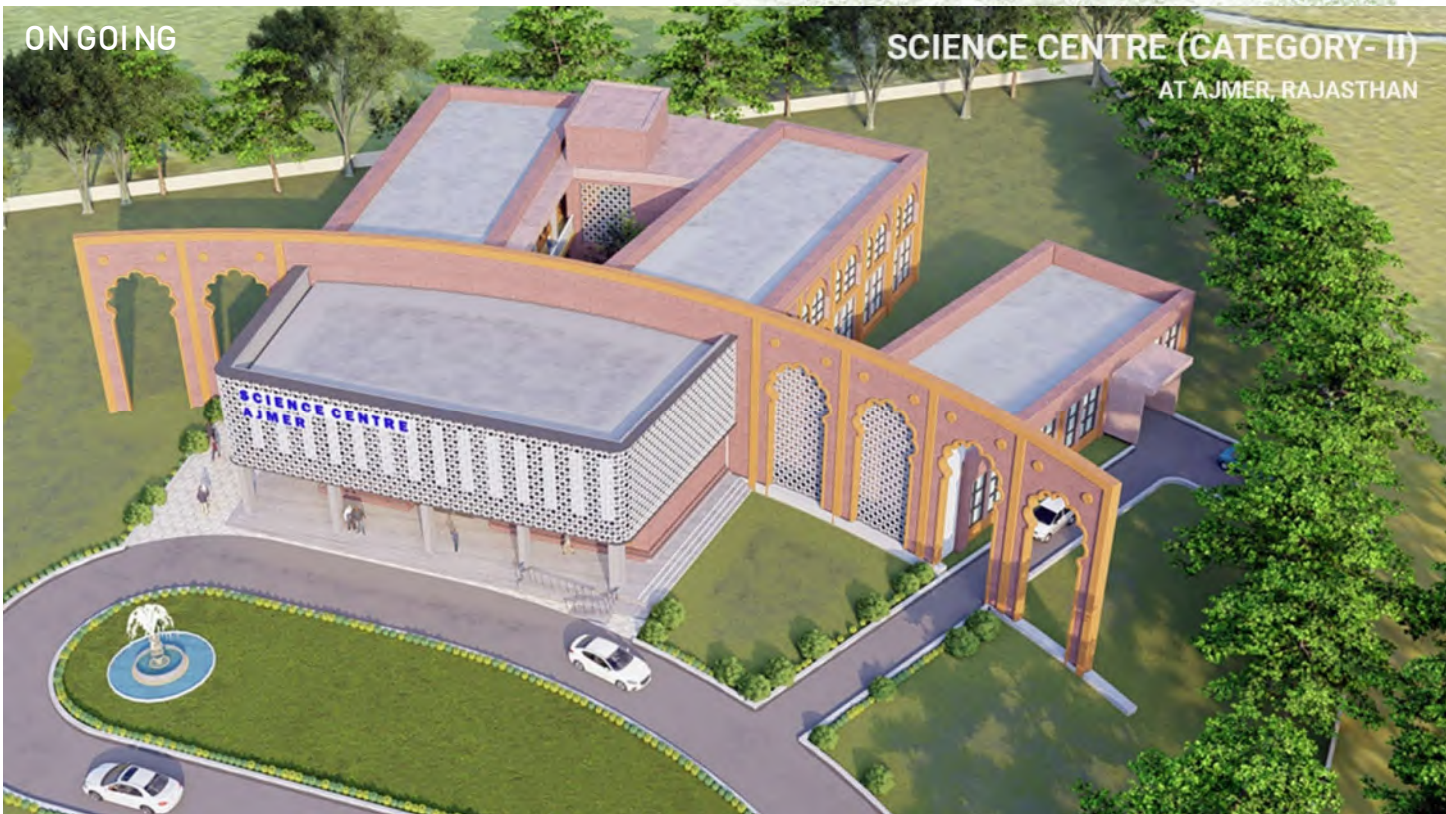
Science Centre (Category- II) at Ajmer, Rajasthan Project Cost: 8 crores/ Area: 2000 sqmt.