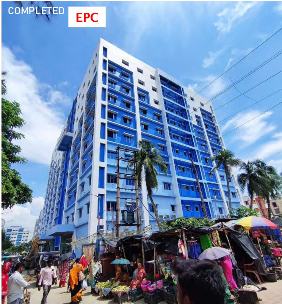
Mother & Child Hub at Diamond Harbour Medical College (600 Bed) Project Cost: 60 crores/ Area: 18000 sqmt.