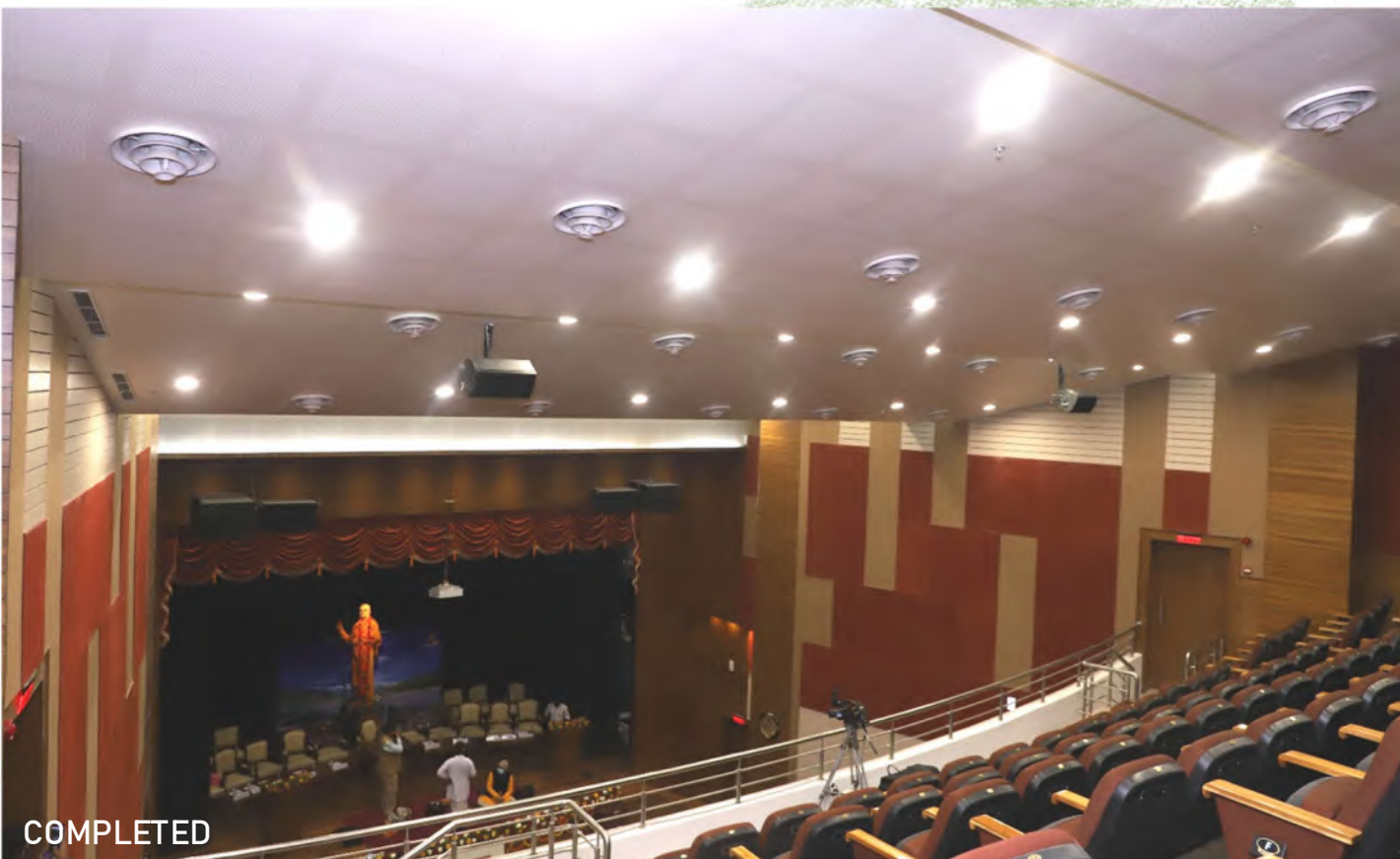
500 seater Auditorium at Swami Vivekananda Ancestral House & Cultural Centre, Kolkata Project Cost: 2.5 crores