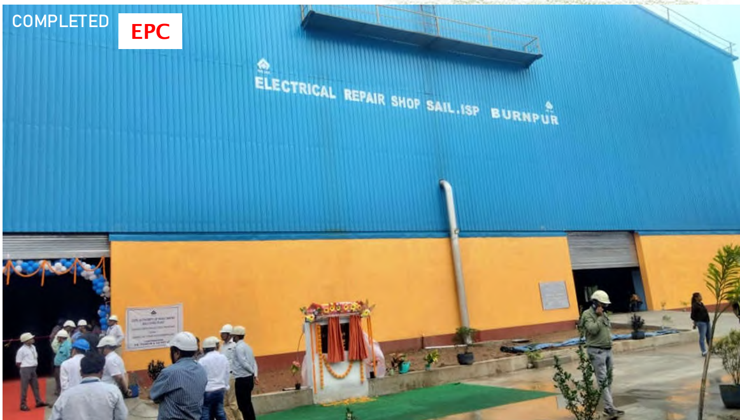
New Electrical Repair Shop Complex (Package- 1) at IISO, Burnpur Project Cost: 22 crores/ Area: 5000 sqmt.