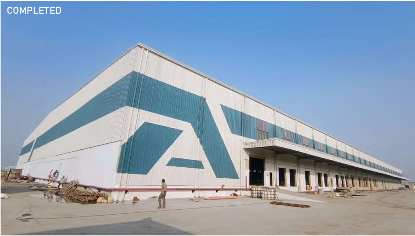
Arora Warehouse Project at Dankuni Project Cost: 50 crores/ Area: 23225 sqmt.