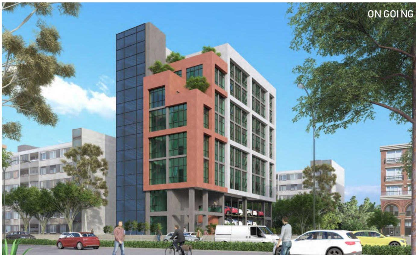
IT Building for Digital Abhiyan Pvt. Ltd. At New Town Project Cost: 10 crores/ Area: 2787 sqmt.