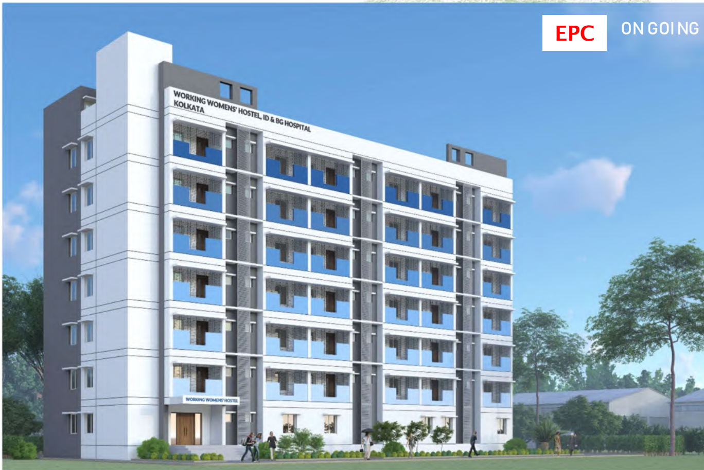
Working Womens' Hostel at ID & BG Hospital Project Cost: 15 crores/ Area: 3300 sqmt.