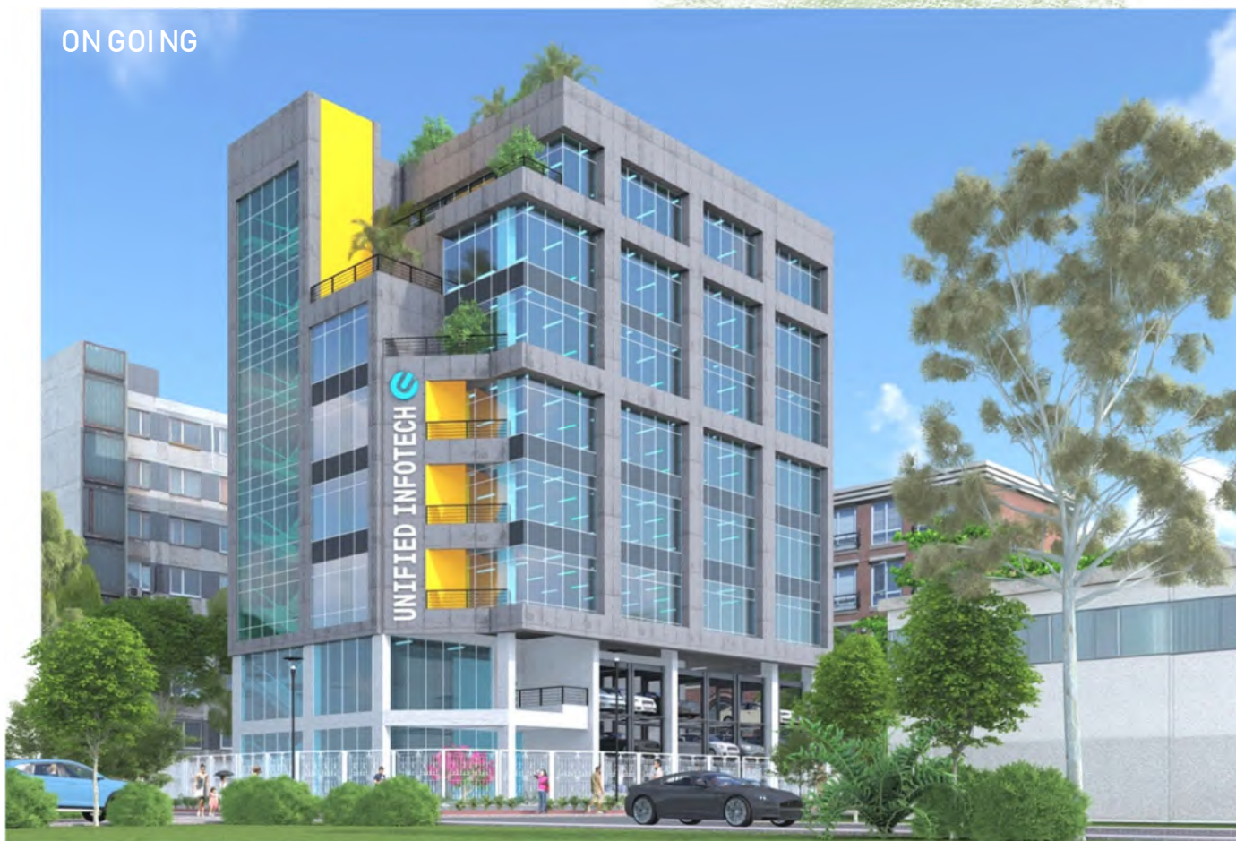
IT Building for Unified infotech Pvt. Ltd. At New Town Project Cost: 10 crores/ Area: 2787 sqmt.