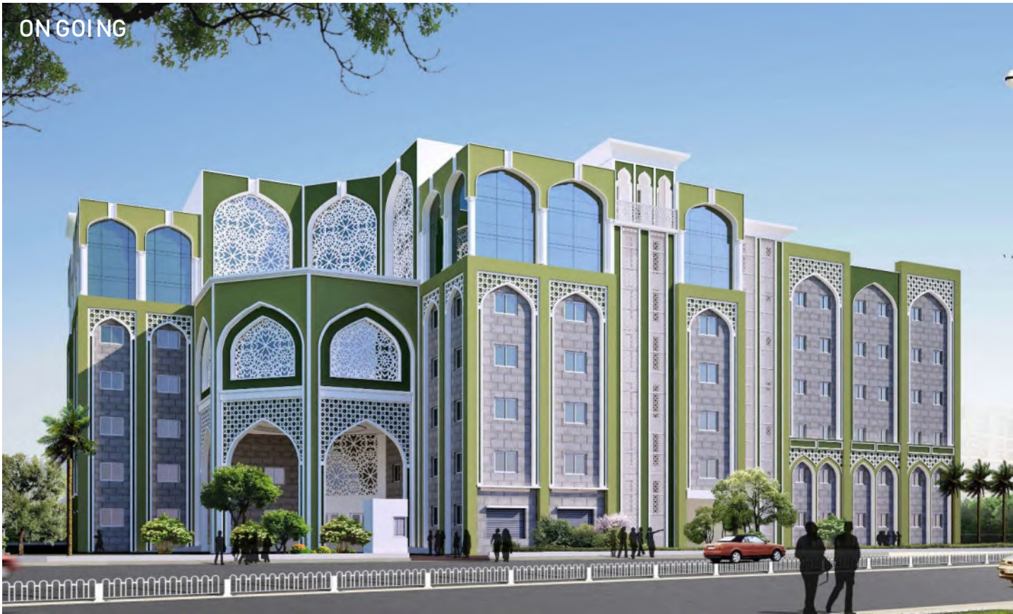
Multy facility Academic Complex for Al-Ameen Mission Trust at New Town Project Cost: 50 crores/ Area: 24000 sqmt.