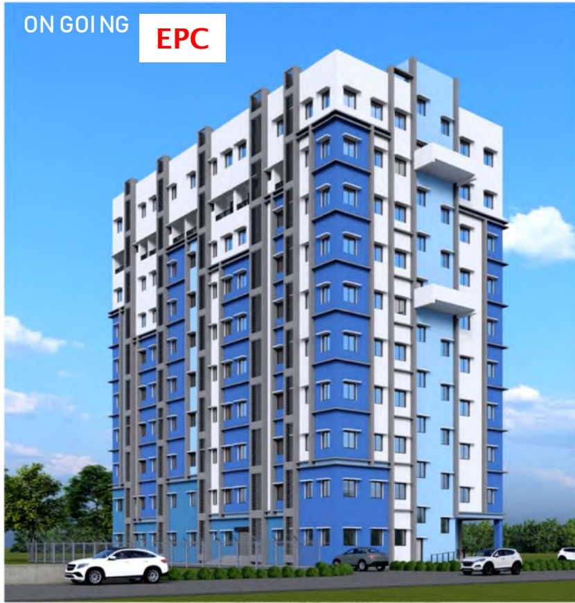
Annexe and Hostel Building for Post Graduate Disciplines at College of Medicine and Sagore Dutta Hospitals Project Cost: 40 crores/ Area: 11500 sqmt.