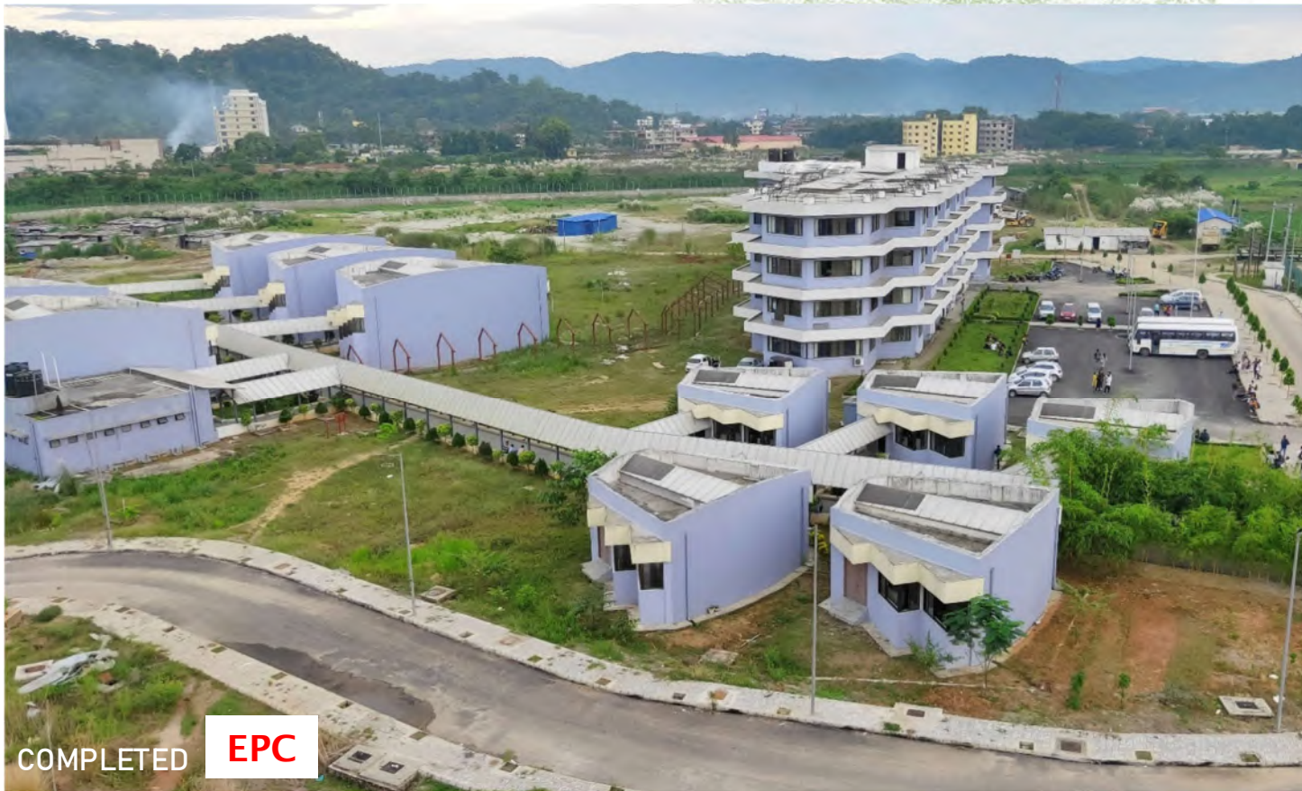
Bihar State Data Centre Building at Patna, Bihar Project cost: 15 crores/ Area: 3252 sqmt.