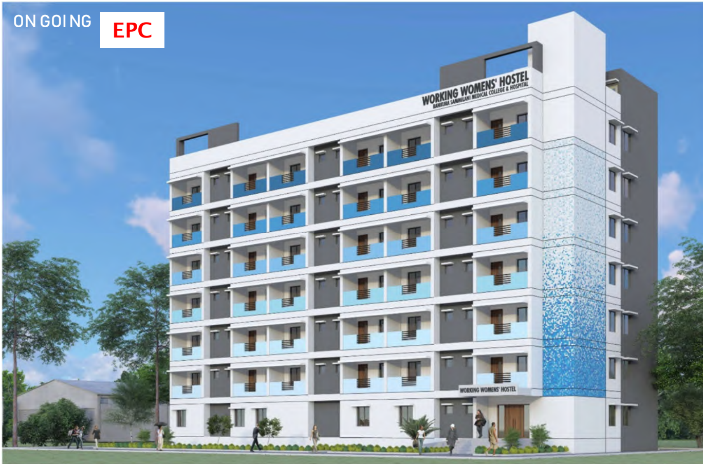
Working Womens' Hostel at Bankura Sammilani Medical College Project Cost: 15 crores/ Area: 3300 sqmt.