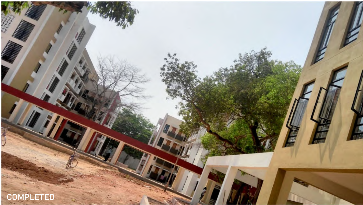
Sister Nivedita Hall of Residence (500 Bed Girls Hostel) at IIT, Khp Project Cost: 39 crores/ Area: 16258 sqmt.