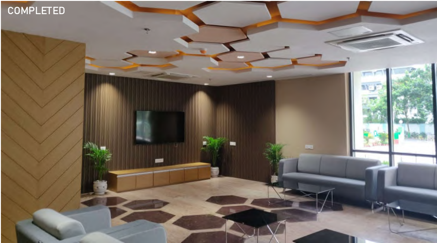
Interior Work at Ground Floor of DVC Tower at Ultadanga, Kolkata Project Cost: 2 crores/ Area: 400 sqmt.