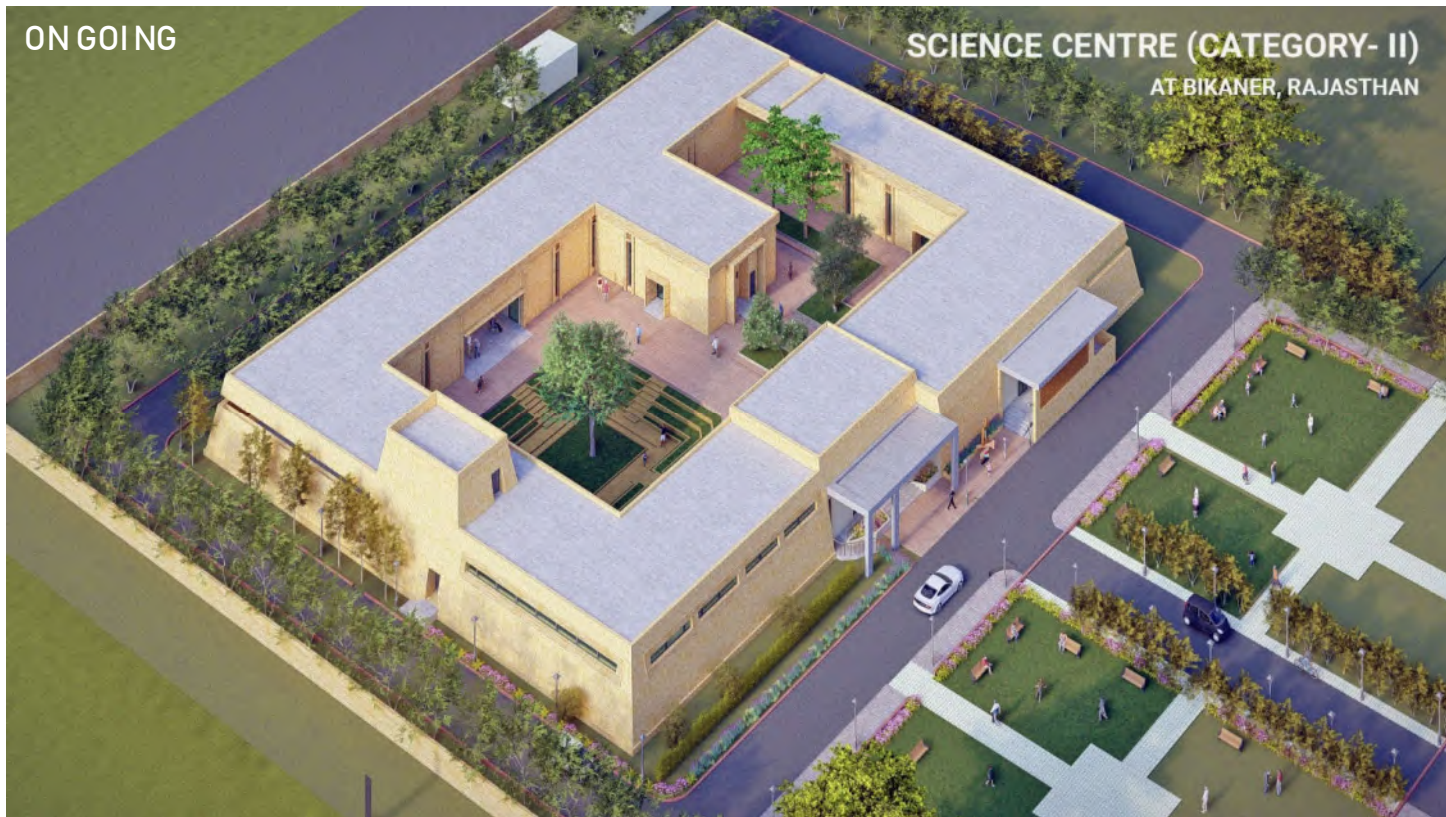
Science Centre (Category- II) at Bikaner, Rajasthan Project Cost: 10 crores/ Area: 2040 sqmt.