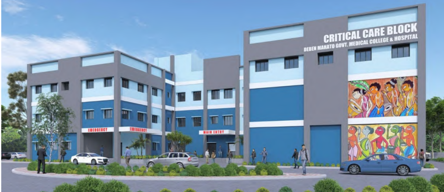
3 storied Critical Care Block (50 Bedded) at Deben Mahato Govt. Medical College & Hospital Project Cost: 16.7 crors/ Area: 3562 sqmt.