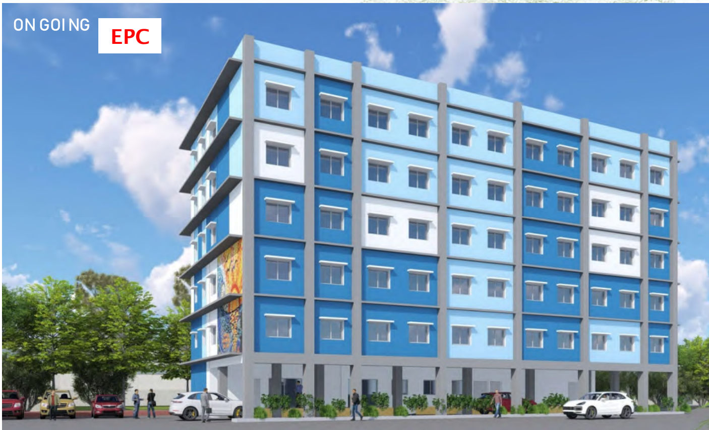
G+5 storied Annexe Building in the premises of Swasthya Bhawan at Salt Lake Project Cost: 15 crores/ Area: 3562 sqmt.