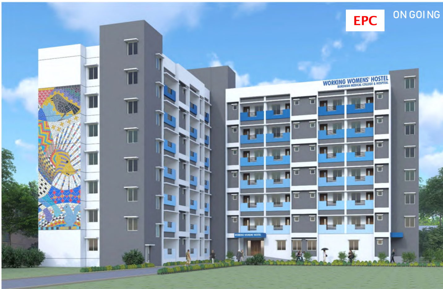
Working Womens' Hostel at Burdwan Medical College & Hospital Project Cost: 33 crores/ Area: 4920 sqmt.