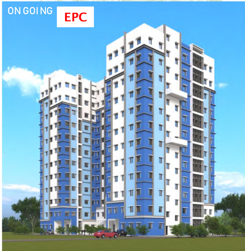
Annexe and Hostel Building for Post Graduate Disciplines at Malda Medical College & Hospitals Project Cost: 70 crores/ Area: 20700 sqmt.