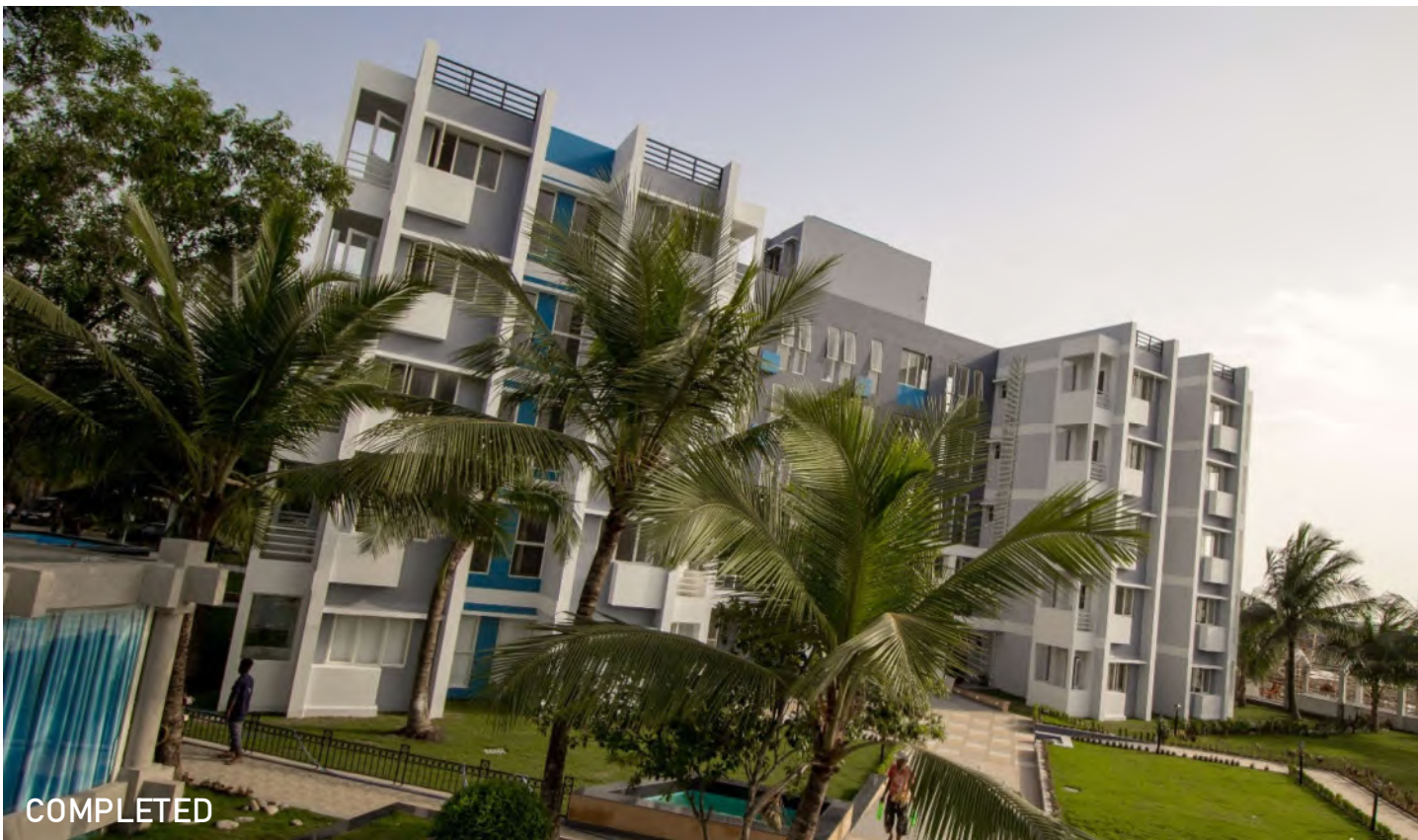
A Senior Living Centre for Sri Aurobindo Institute of Culture at Baruipur Project Cost: 15 crores/ Area: 7432 sqmt.