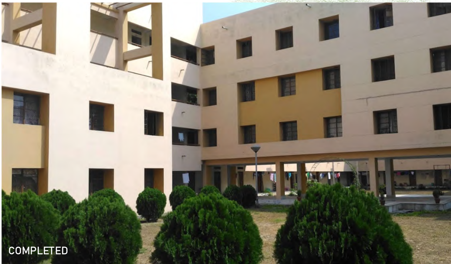
Gems Akademia International School for Anand Education Trust at Joka Project Cost: 32 crores/ Area: 18000 sqmt.