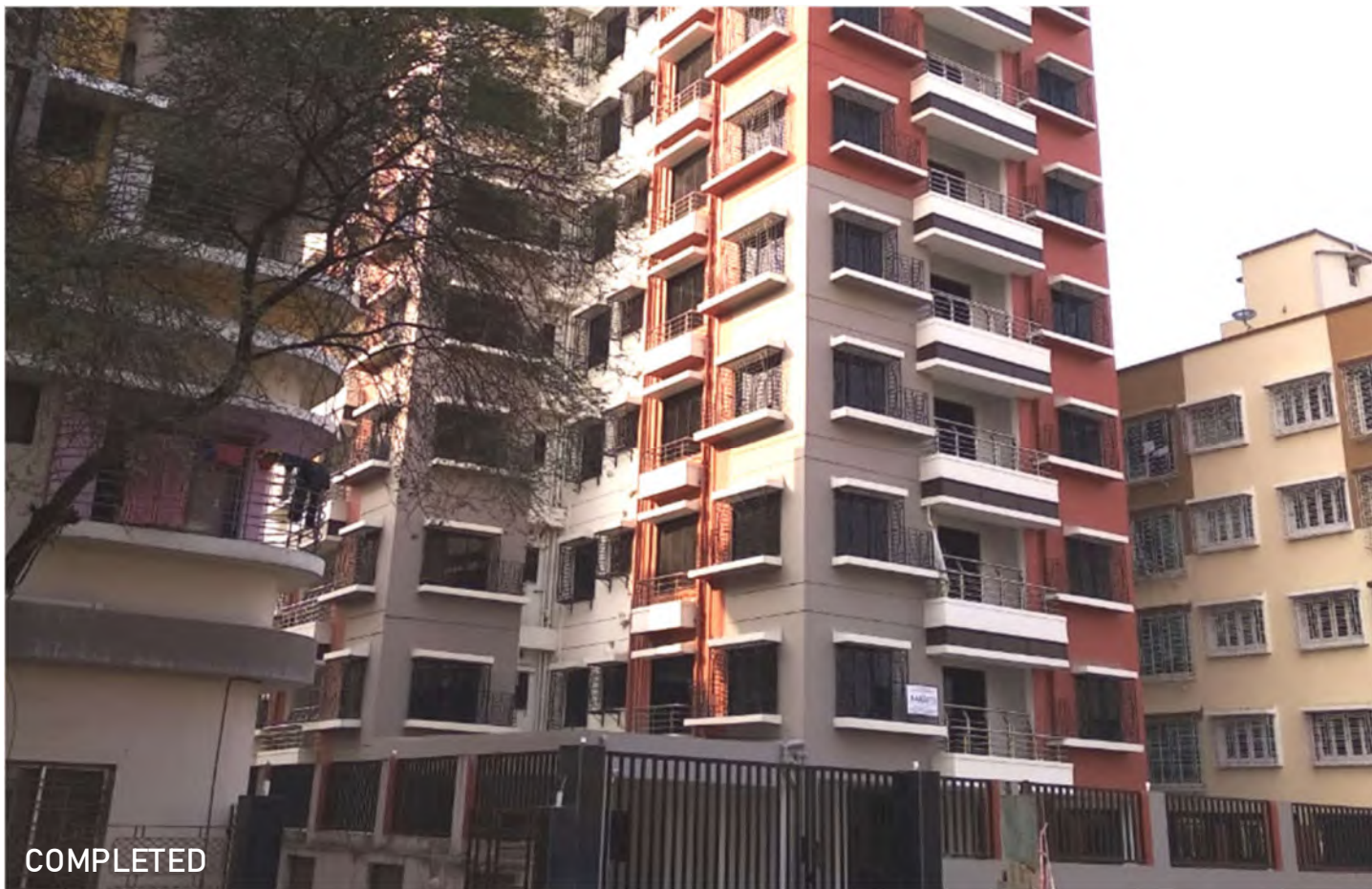
Airport Housing Co-op Society Ltd. at New Town Project Cost: 10 crores/ Area: 3716 sqmt.