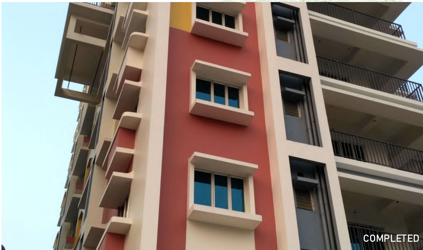
BE College Housing Co-op Society Ltd. at New Town Project Cost: 10 crores/ Area: 4000 sqmt.