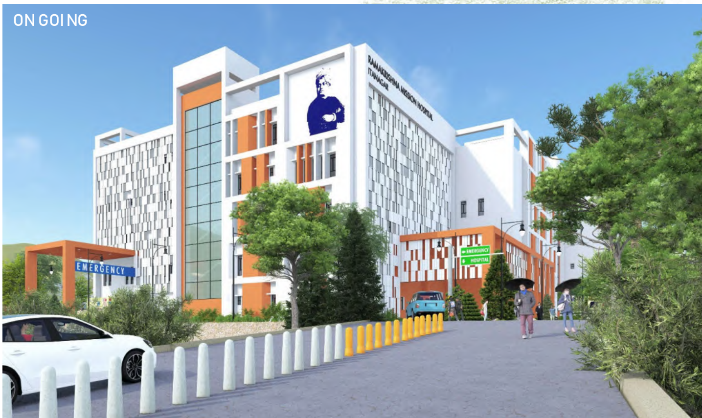
Super Specialty Hospital Building for Ramakrishna Mission at Itanagar Project Cost: 80 crores/ Area: 17650 sqmt.