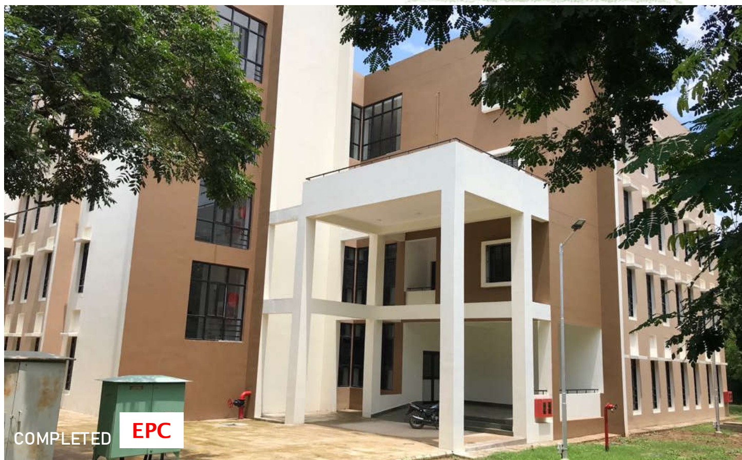
Extension of the Dept. of Aerospace Engineering at IIT, Kharagpur Project Cost: 9 crores/ Area: 3100 sqmt.