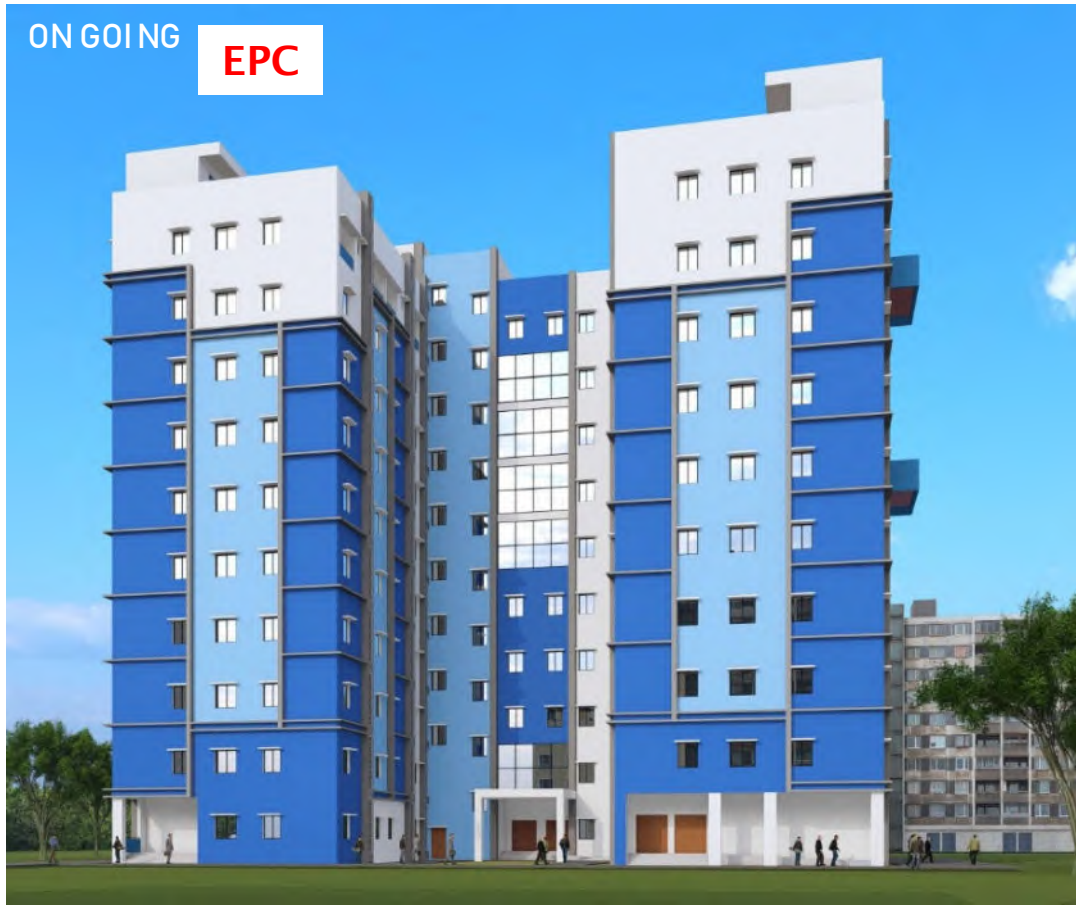
Annexe and Hostel Building for Post Graduate Disciplines at Diamond Harbour Govt. Medical College Project Cost: 65 crores/ Area: 19930 sqmt.